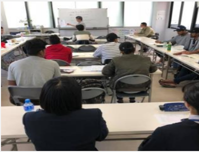
November Interacting with locals