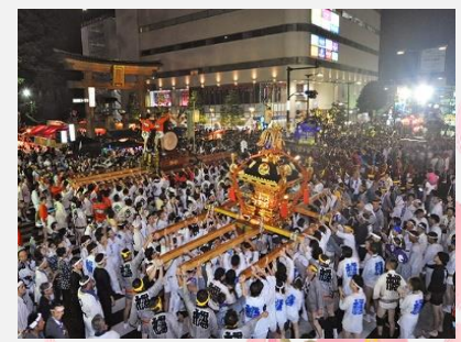
September Miya Festival