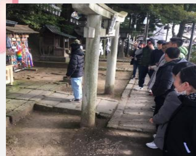
January The New Year