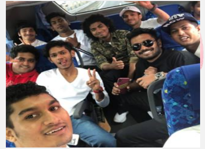
June School Trip