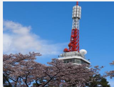
October Entrance Ceremony