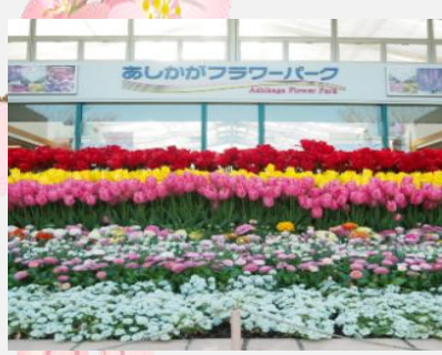
May Golden Week