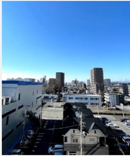
View from the rooftop