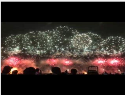
August Fireworks Festival