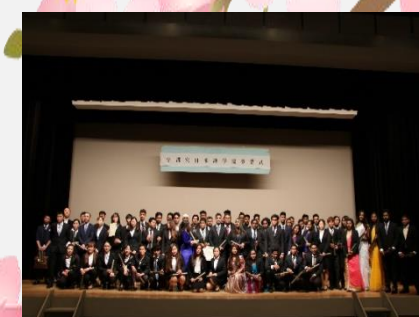
March Graduation Ceremony