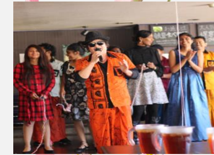
December Christmas Party