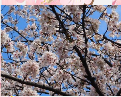
April Entrance ceremony